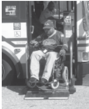
Reliable, accessible bus service is vital for disabled, low-income and minority communities.

To document the travel characteristics of minority and disadvantaged population groups in the Washington region, TPB staff analyzed data from the 2000 Census. According to the Census, the largest minority group in the region is African American, representing 27 percent of the population. Asians and Hispanics represent 7 and 9 percent of the population, respectively. Disadvantaged population groups include low income individuals (17 percent) limited English speakers (5 percent), and individuals with physical or sensory disabilities (8 percent).